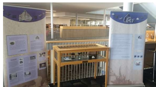
Photos show prior venue exhibit display examples